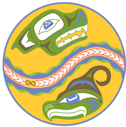
Indigenous Education nvsd

The NVSD Indigenous Education Team and the West Vancouver School District are co hosting a youth writing contest. This writing contest is open to students currently in Grades 8-12 in either the North Vancouver School District or West Vancouver School District